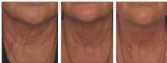
Before treatment After 1 month After 2 months

Tests were carried out on 26 female volunteers with sagging skin aged 54 to 75 years old. Women applied twice a day a cream containing 4% Idealift™ for 2 months. Effects of this new active ingredient were proven after just one month. They were confirmed by using various evaluation techniques (Aeroflexmeter® a new device developed and patented by Sederma, FOITS and self-evaluation). The visible effects of gravity decreased and cutaneous sagging was fought and for 80% of panalists their skin was firmer.