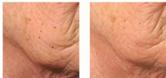
Before treatment After 1 month